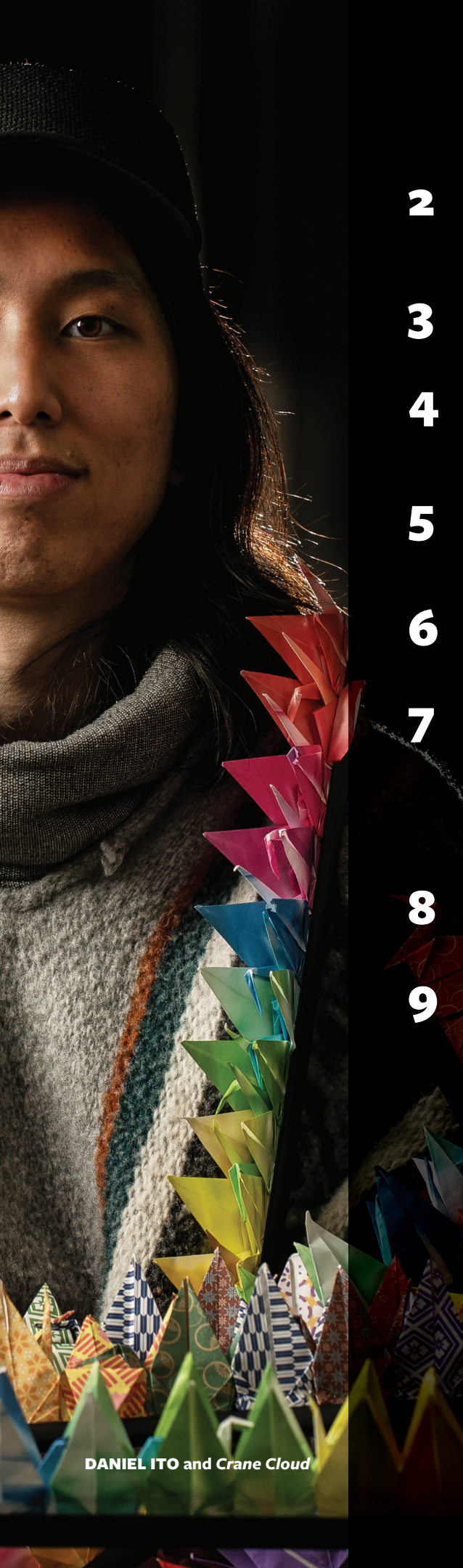
DANIEL ITO and Crane Cloud