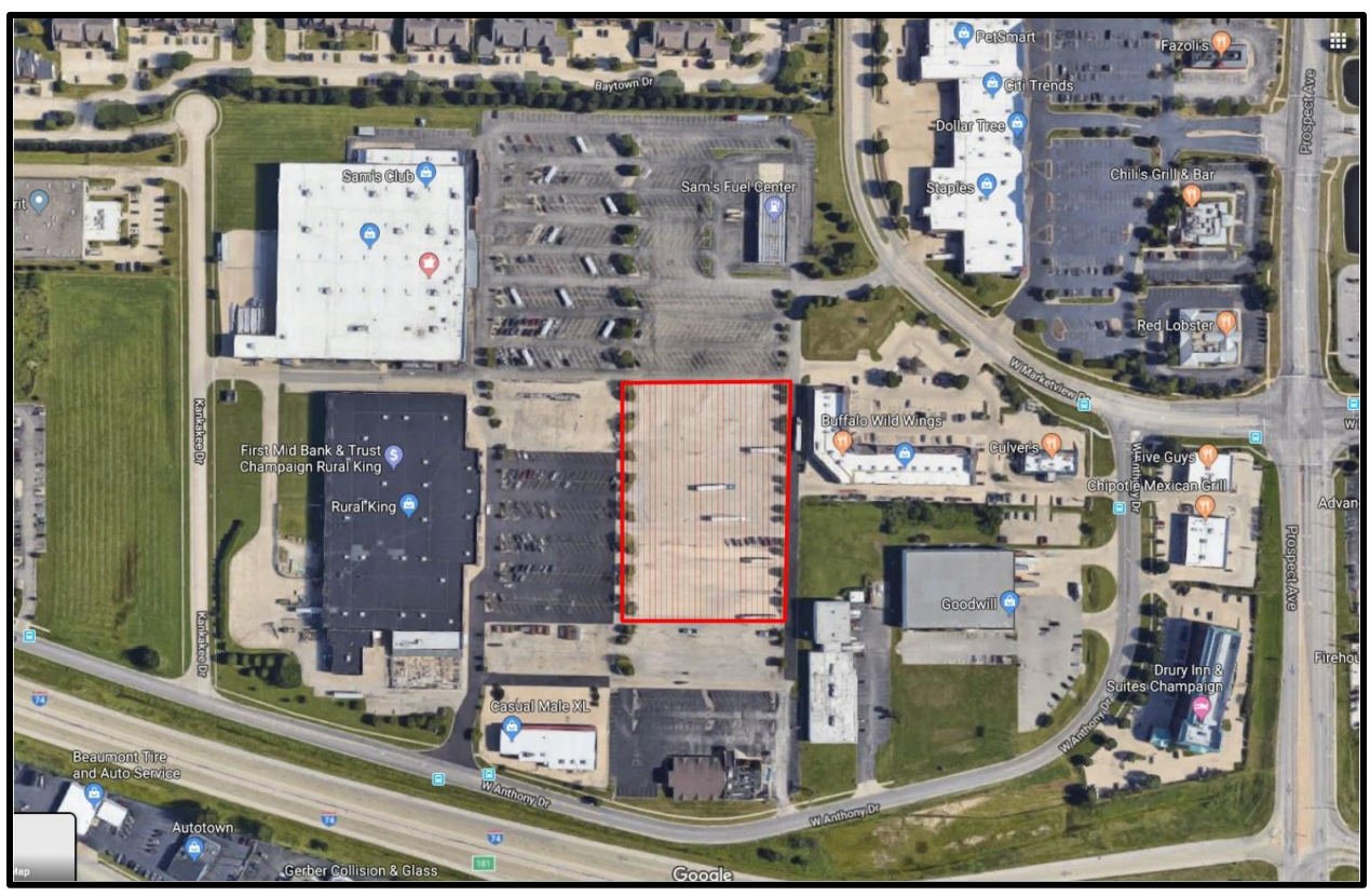
Tractor Trailer Truck Driving School